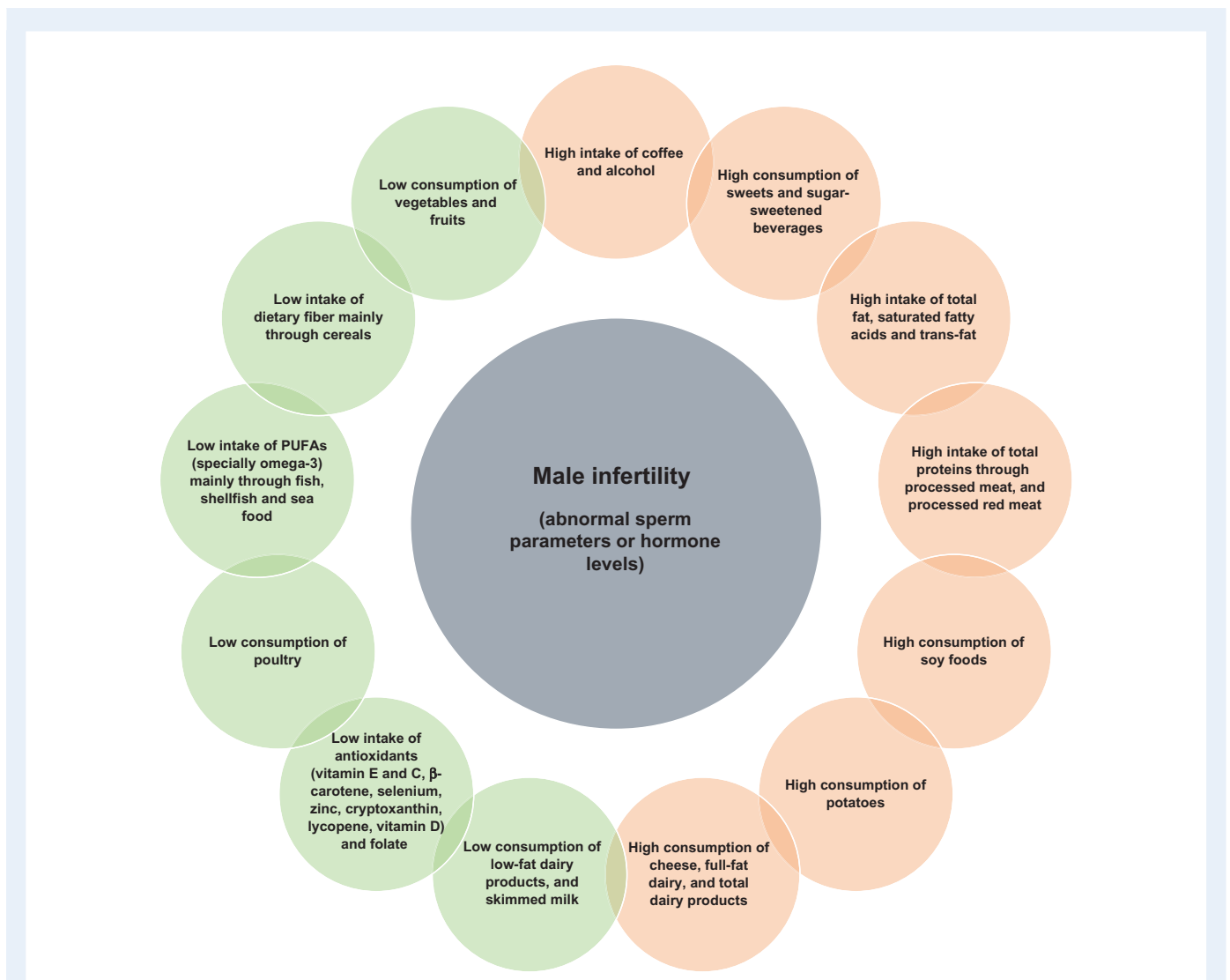
Figure 2 Nutrition-related factors reported in this review that were associated with male infertility. Different colors denote the type of association with male infertility: positive association in green and negative association in orange.

There is a direct association between antioxidant status and the production of reactive oxygen species (ROS) in spermatozoa (Ross et al. , 2010). In addition, high concentrations of ROS negatively affect sperm